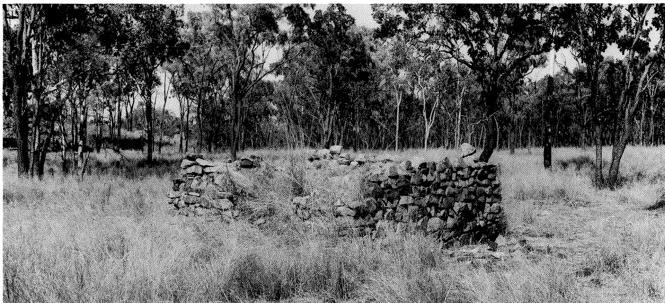
Fig. 8: Stone building in the town of Calcifer (J. and R. Kerr, 1974).