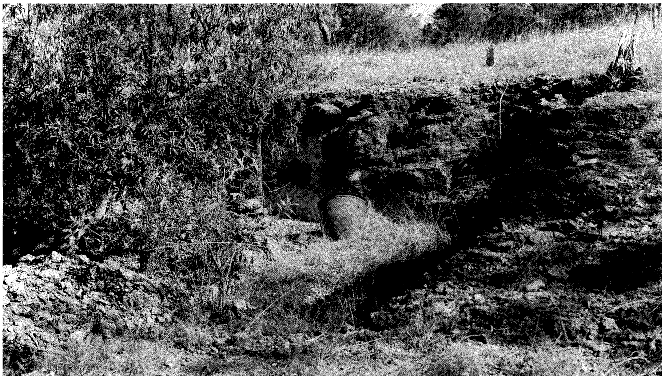
Fig. 7: The remains of a boiler, Calcifer Creek (J. and R. Kerr, 1974).