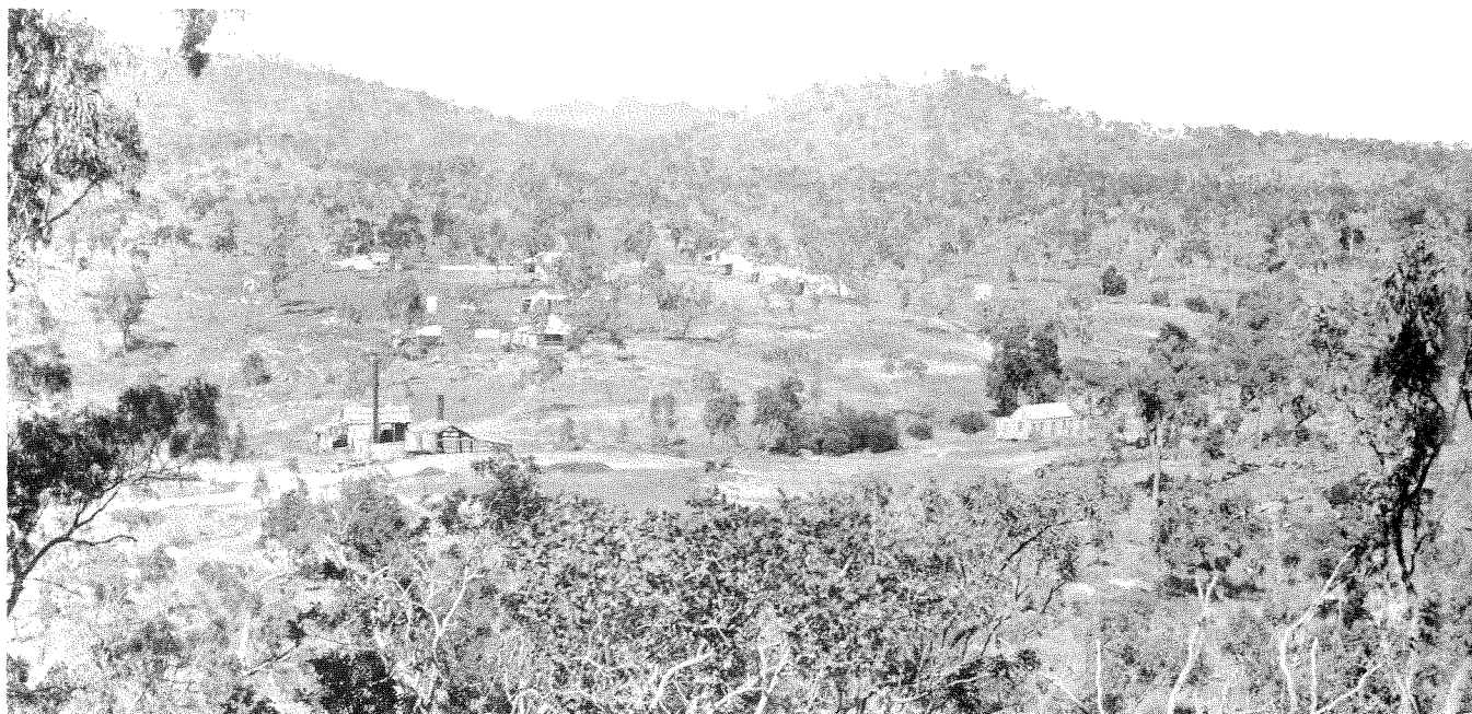
Fig. 3: Calcifer town and smelters, 1900.

There were only two teachers. Joseph Krause of Mount Cotton opened Calcifer school on 12 March 1900 with an