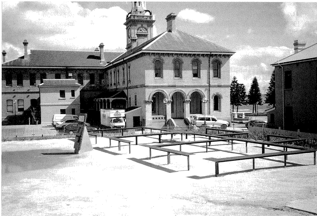
Figure 6. The location of buildings at the Newcastle penal station Lumber yard outlined for public interpretation (C. Allen).

Archaeologists need to incorporate the changing historical understanding of convict transportation into their analyses. When convict transportation is seen as one particular manifestation of forced global migration, comparable to North American and Caribbean slave trading, Russian colonisation of Siberia and other examples, it opens the prospect of a far greater comparative context for understanding the archaeological evidence. It provides the prospect for new means of investigating specific sites in a way that makes their archaeology meaningful to a world context.