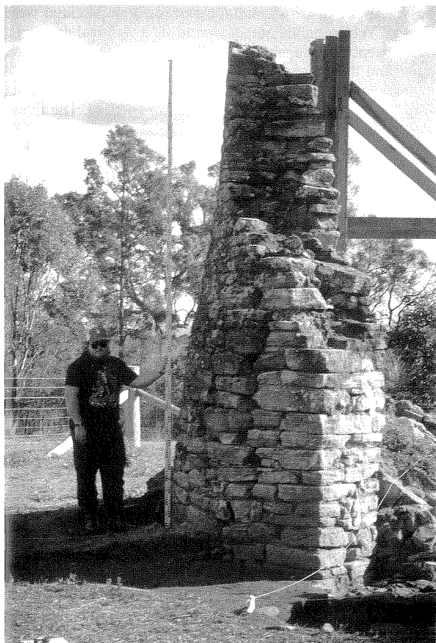
Figure 5. The remains of the convict-built windmill at Thomas Arndell's farm, now within Cattai National Park (D. Gojak).

pasture and stock improvement, fencing and mechanisation have totally transformed the landscapes that remain.