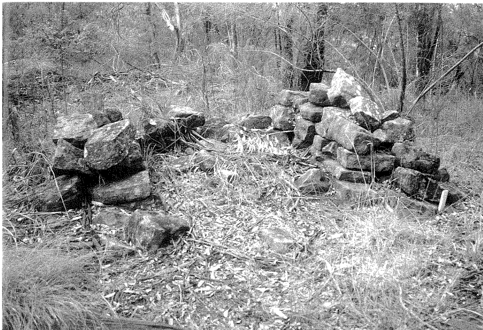
Figure 3. Convict accommodation structure, possibly a fireplace, at the presumed earlier stockade on the descent to Wisemans Ferry (D. Gojak).

individual rebellion and subversion that could survive the archaeological record.