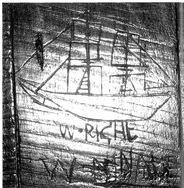
Figure 2. Ship and names inscribed into the wooden cell walls at Hartley Courthouse.

Barracks were important throughout the convict period for marshalling larger numbers of convicts into readily controllable situations. The prime example still extant, and the subject of significant archaeological work, is the Hyde Park