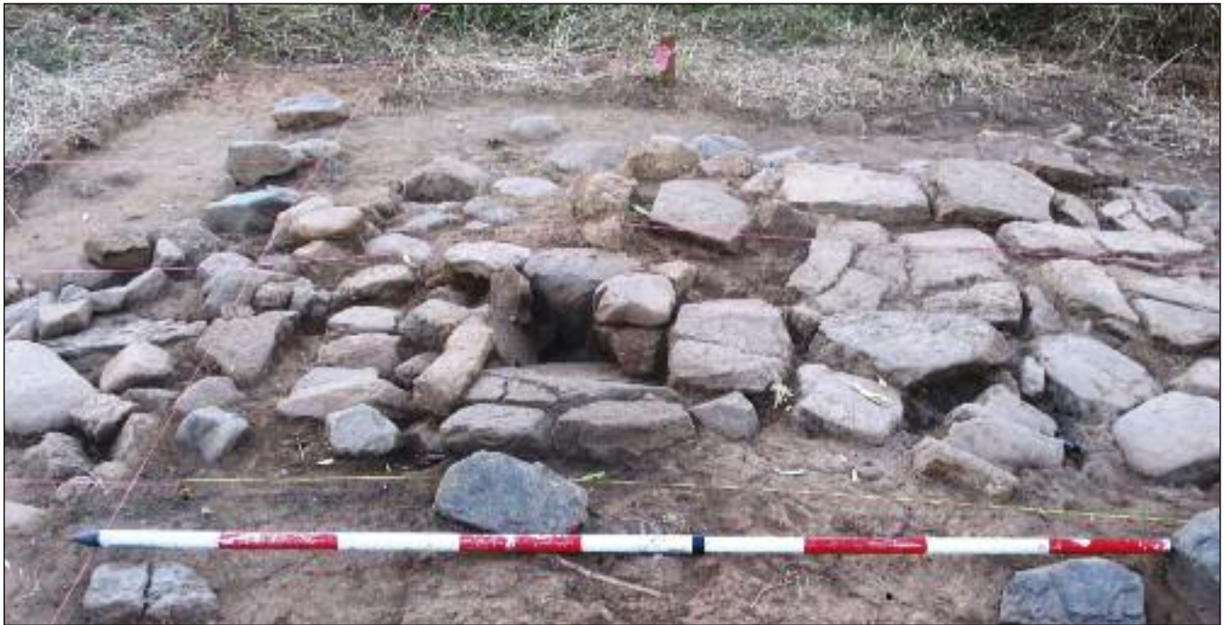
Figure 3: Looking north showing the platform to the right with the 'forge' to the southwest corner. A possible post hole can be seen to the top right of the forge.

A well-constructed stone 'forge' was revealed towards the southwest corner. This had a base made from one large flat rock, cracked into two pieces, which sloped down to a charcoal-filled hole at a depth of 20 centimetres. Multiple small metal fragments were also mixed in with the charcoal. The low walls surrounding this base were built up using