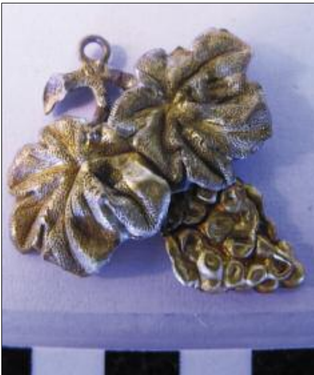
Figure 5: A small gold pendant.

Alcohol related items included a complete green bottle neck with applied ring finish (dated from the 1880s to the mid-20th century), thick black glass from bottle bases and finishes