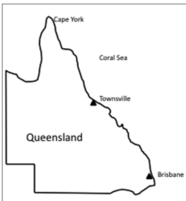
Figure 1: Map of Queensland. 'The Range Hotel, Burial Ground and Camping Reserve' is located 36 km inland of Townsville.