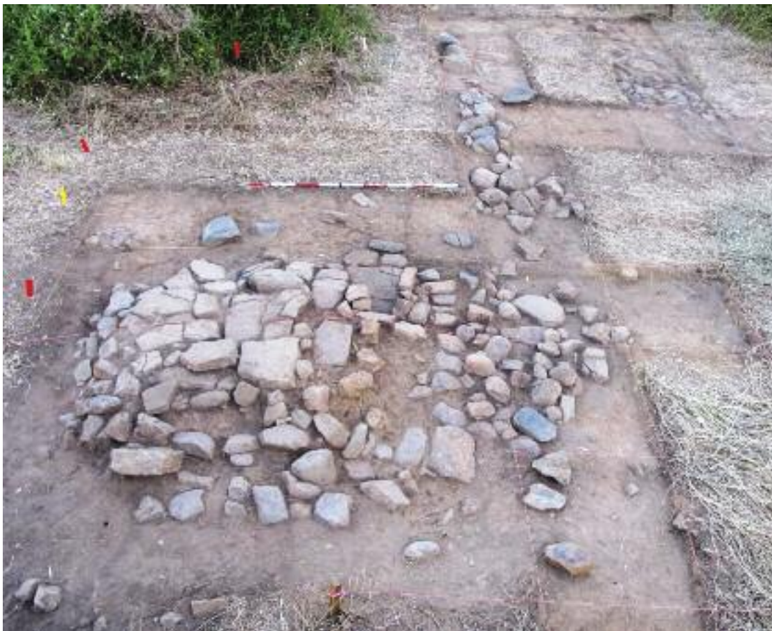
Figure 4: Looking south showing the layout of the whole site with the platform and forge to the front and the second stone feature in the upper right corner.

The second stone feature (Figure 4) was located to the southwest of the platform and appeared to be composed of one