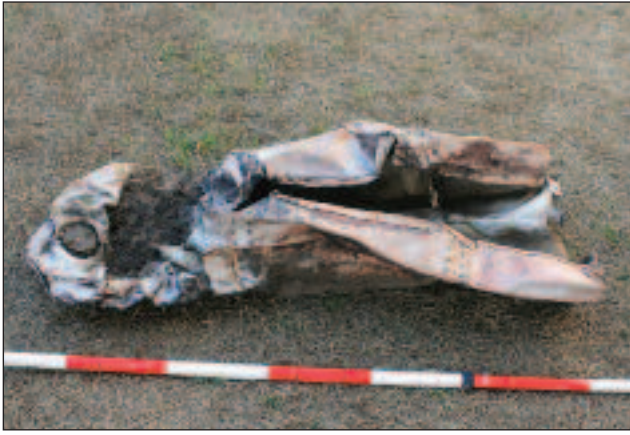
Figure 7: Crumpled drop tank from a Japanese zero (T. Owen).