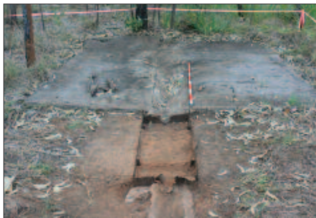
Figure 5: Kitchen slab and grey water system (T. Owen).