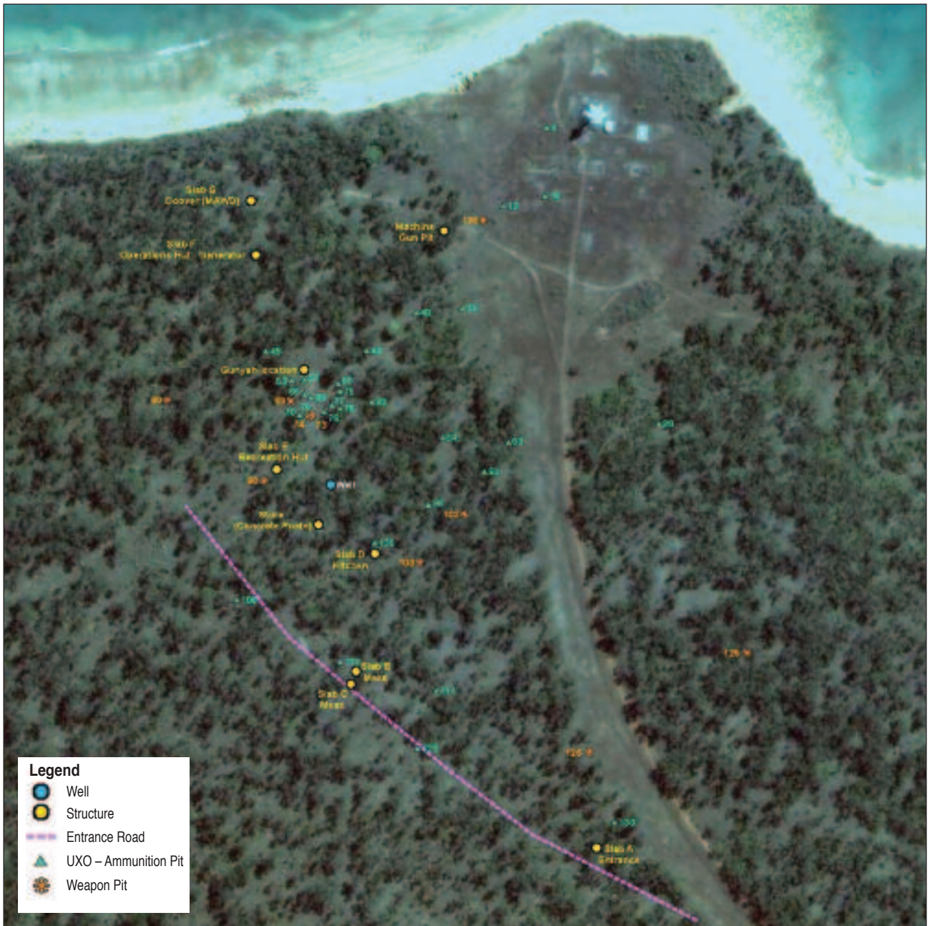
Figure 4: The layout of 105 RDF, as recorded in 2010, showing structures and ordnance (Owen and James 2010b:Figure 5).

identified small metal items, particularly spent cartridge cases, which would otherwise not have been observed or recorded due to the thick vegetation cover. In addition the pattern of spent ammunition and weapons pits provided evidence for the spatial use of the wider bush zone, otherwise devoid of signs relating to its WWII use.