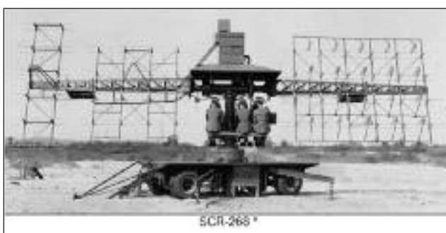
Figure 2: Exposed operators sat on a SCR 268 (NB this photograph is not of 105 Radar Station).

Of all the MAWDs, 105RS was probably the most outstanding due to its deployment to the Northern Territory. The situation in Darwin at the end of March 1942 can only be described as being extremely desperate. Certainly 3IRS at Dripstone Caves was operating ... but additional air warning was an urgent