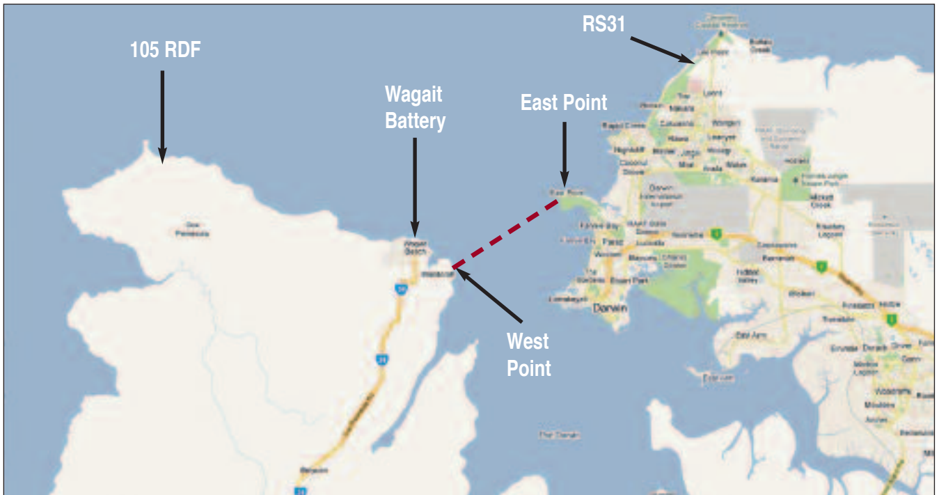
Figure 1: Key WWII Defences on the Cox Peninsula, East Point and RS31. Red line is the submarine net extending between East and West point.

acquired by the Royal Australia Air Force (RAAF) who modified it to become a land based system able to detect aircraft up to 160 kilometres away. After modification the SCR268 was known as the Modified Air Warning Device (MAWD). Eight MAWDs, numbered 101–105, 107 and 109, were set up in various defensive locations across Australia (Fenton 2000:10; Simmonds and Smith 1995). Simmonds and Smith describe the introduction of the MAWDs to the RAAF: