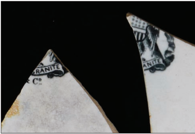
Figure 2: Backstamp on white granite sherds (C Hughes 2015).