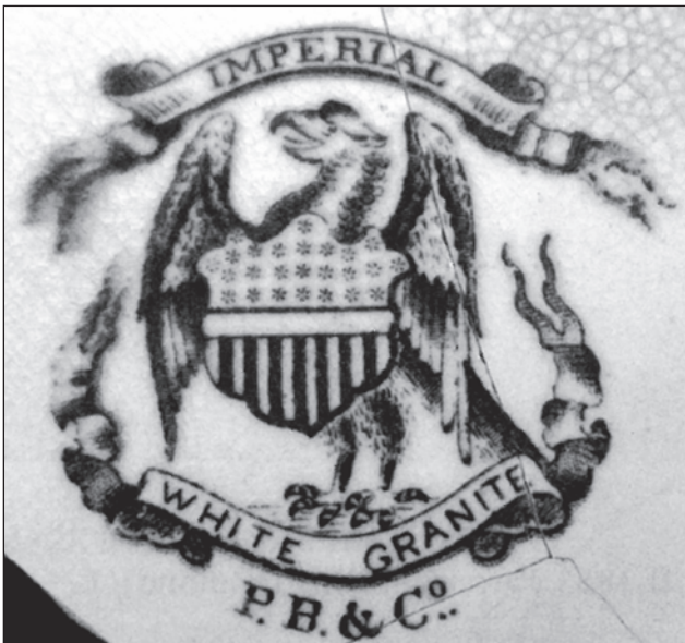
Figure 3: Mark 295 from Gibson (2011:120).