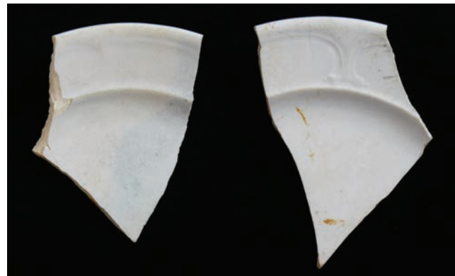
Figure 1: White granite sherds from Short Street, Brisbane (C. Hughes 2015).

Two sherds of white granite (Figure 1) have been identified from a collection of artefacts donated to The University of Queensland by Environmental Resources Management Australia Pty Ltd (ERM). ERM undertook archaeological salvage activities at 1 William Street in Brisbane City that included only a very preliminary artefact analysis. The company's report recommended more detailed analysis be conducted (ERM 2014:C1) and the donated artefacts are currently being used for the teaching of artefact analysis. It was during this process that the two sherds of white granite were identified.