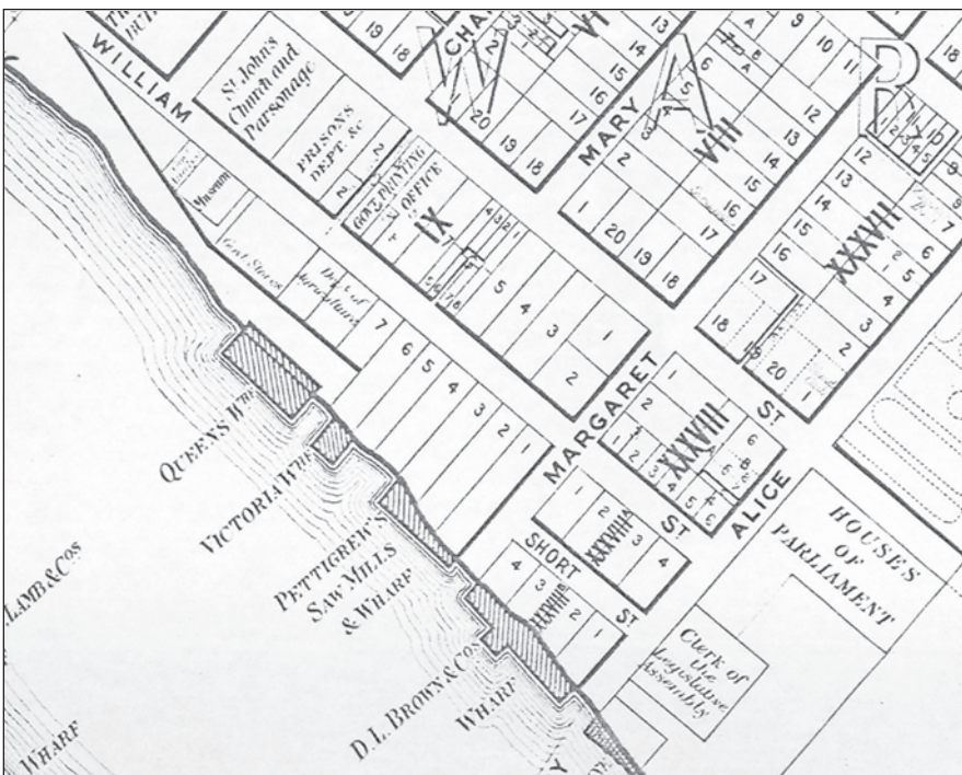
Figure 4: Detail of 1895 McKellar Map of Brisbane. Allotment 4, Section 38A is at the corner of Short, Alice and William Streets.

1854). The lot was bounded to the north east by William Street, to the south east by Alice Street and to the south west by an unnamed street later gazetted as Short Street. The lot became No. 26 Short Street, but was also known as 26 Alice Street.